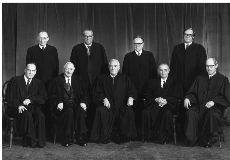
The Supreme Court of the United States in “The Brethren” years. Above, in October Term 1972. Back row (left to right): Lewis F. Powell, Thurgood Marshall, Harry A. Blackmun, and William H. Rehnquist. Front row (left to right): Potter Stewart, William O. Douglas, Warren E. Burger, William J. Brennan, and Byron R. White. Below, in October Term 1975. John Paul Stevens (back row, far right) has replaced William O. Douglas.